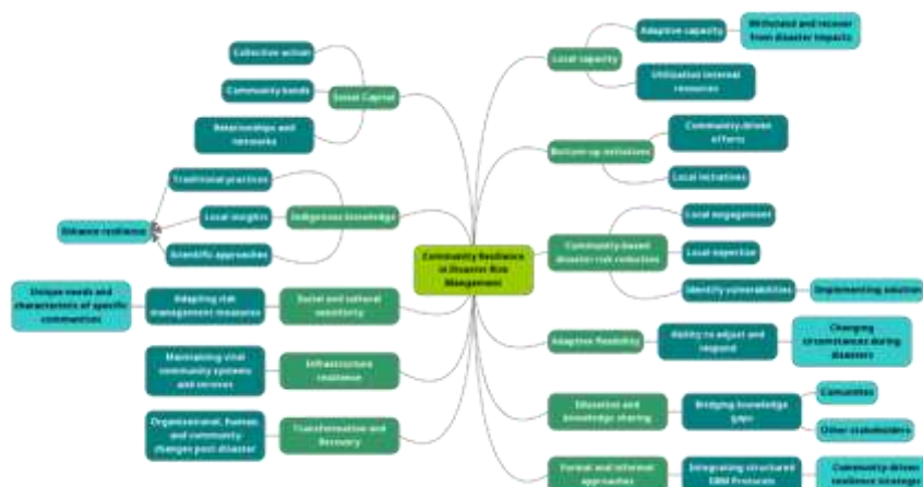
Figure 4. Key themes of Community Resilience within the context of Disaster Risk Management

The Special Region of Yogyakarta comprises 414 villages that are susceptible to disasters, with risk levels ranging from medium to high, and is distributed throughout the city and its four regencies. In most areas, earthquakes remain the greatest threat, followed by floods and landslides. Tsunamis are the least common disaster risk and only affect villages that border shorelines in the southern parts of the province. Some villages often pose multiple disaster risks that require different risk-management strategies. For example, many villages situated along the coastlines in Bantul regency are exposed to multiple disaster risks, including floods, earthquakes, and tsunamis. On the mountainside such as Kulonprogo and Gunungkidul Regencies the risks of disasters typically include landslides, droughts, and land and forest fires. Based on the map above, building community resilience is key to effective disaster risk management, especially in villages at risk of multiple disasters. From the results of the analysis, several points should be noted on how to incorporate community resilience into disaster risk management strategies, as shown in the thematic map below.