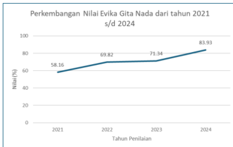
Figure 2. Development of Evika Gita Nada Values from 2021 to 2024

EVIKA's assessment of the Gita Nada conservation area has been carried out since 2021 to assess the effectiveness of area management carried out in the previous year. Until now, EVIKA Gita Nada assessments have been carried out 4 times which have increased in value every year.